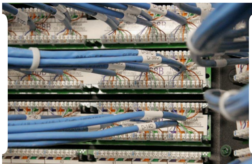
A part of the complete NextLAN solution, Leviton's 110-style Patch Panels in flat and angled configurations along with Superior Essex cable provide easy termination and offer guaranteed performance.

Cherokee Cabling has completed a rigorous training program designed and continuously refined by RCDD experts. As is the case with all projects, every permanent link in the NextLAN system is thoroughly tested and