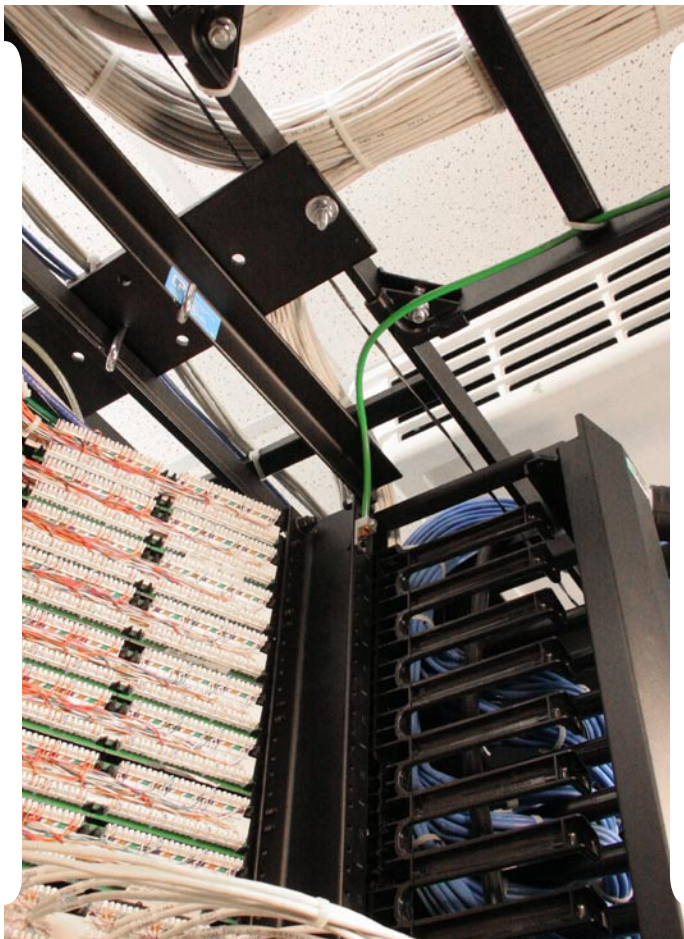
The robust NextLAN system supports flexible technologies including VoIP, PoE and video conferencing.

For more information on the NextLAN difference, including the unique performance verification program and comprehensive Campus Warranty, please visit www.NextLANsystems.com .